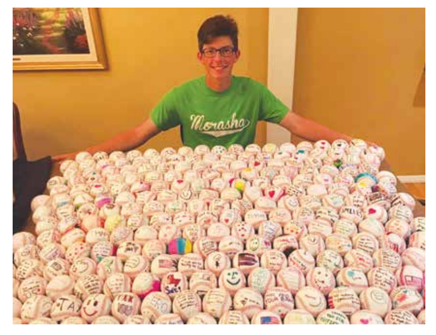
Areyvut has partnered with Billy's BASEballs to send baseballs with messages of hope to soldiers overseas