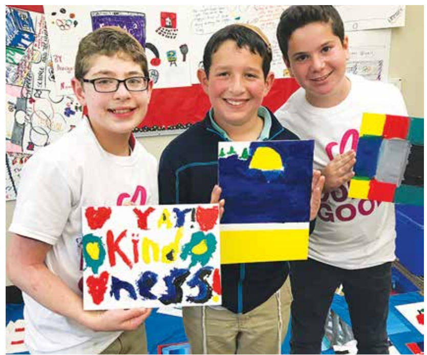
Messages of kindness

given to a teacher, a bus driver, a classmate, even a random stranger – basically anyone who needs a quick pick-me-up. "It's a vehicle to spread cheer and hakorat hatov ," Rothner explains. "The impact is so simple but also so powerful and inspiring."