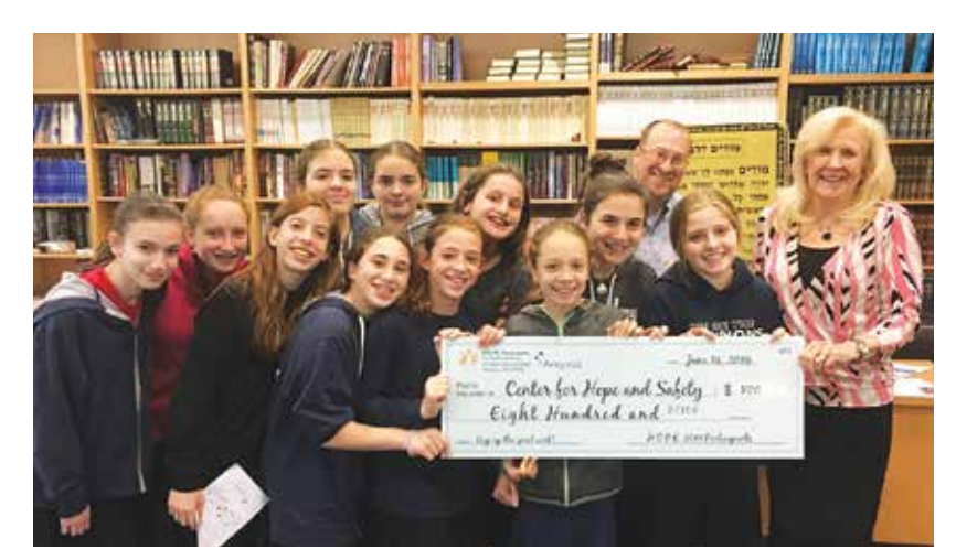
The check presentation from the H.O.P.E. Teen Philanthropy program

Sometimes chessed isn't about the time or the money. Sometimes it's