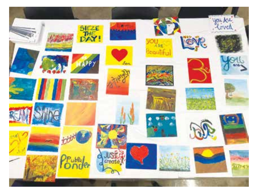
Individual canvases designed at a recent Paint for a Purpose event